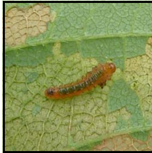
3-Aug-2008, maybe Atomacera debilis only one found feeding on Desmodium (evidence of many). Still feeding.