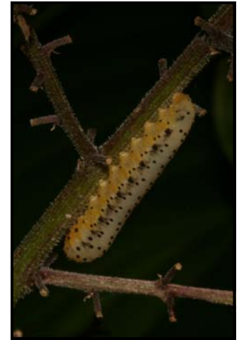
30-Jul-2008, many, Phymatocera sp., defoliating Smilacina racemosa , false Solomon's seal. Failed to raise 2006, 2007 and searched too late in 2008.