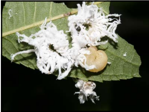
30-Aug-2008, Eriocampa juglandis , feeding on Juglans nigra , walnut. Failed to raise in 2008, found some last week, still feeding.