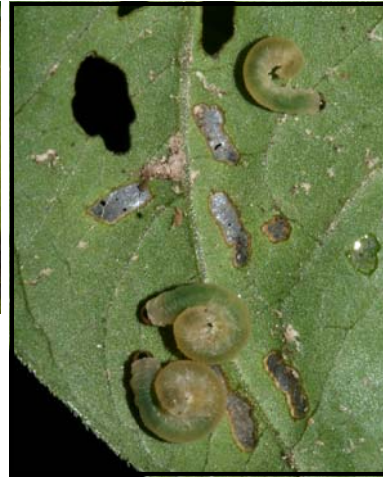
2-June-2009, SUCCESS! Monostegia abdominalis eating Lysimachia ciliata .