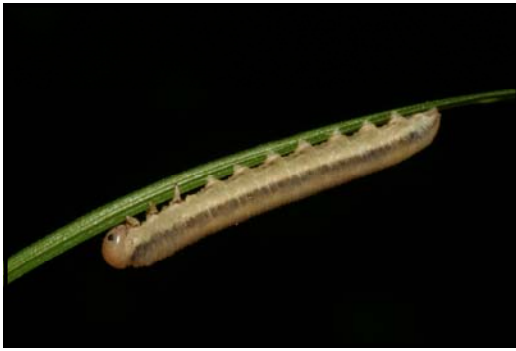
23-May-2008, Pachynematus sp. or Dolerus sp., lots of individuals on grasses (or sedges). Failed to raise.