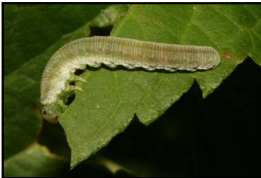
17-Jul-2008, still feeding on Eupatorium rugosum , white snakeroot