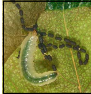
28-May-2009, leaf blotch miners on Crataegus sp, hawthorn, All Died