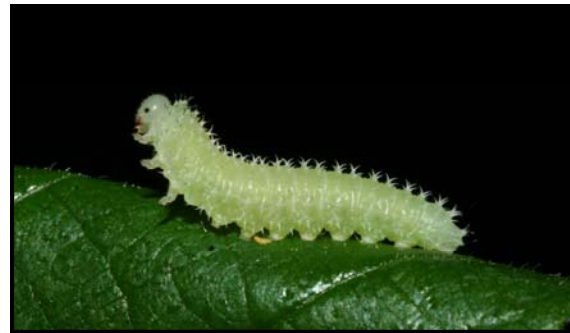
31-May-2009, Perhaps Monophadnoides (Blennocampa) rubi . Collected on raspberry. Later instar smooth. But it died.