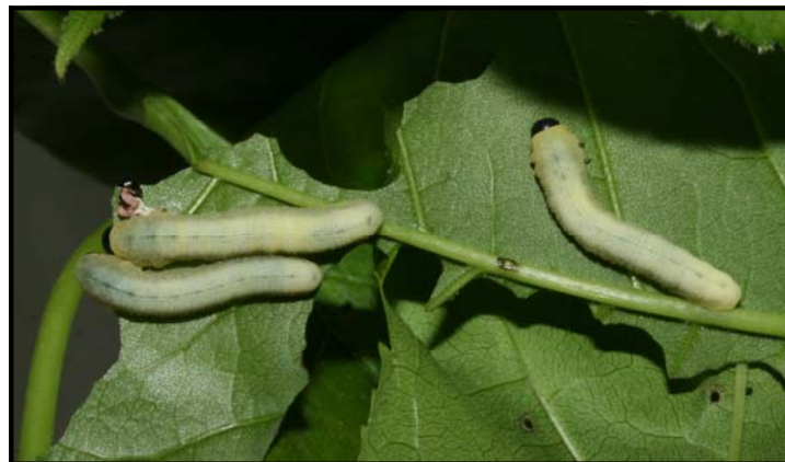
29-May-2009, found feeding on Carya ovata , shagbark hickory, but all died (drowned)